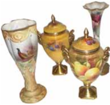
Lot 331, 323 & 332