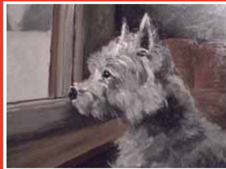
Lorna Millar - Oil