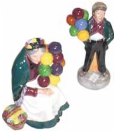
Lot 228 & 229