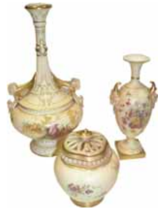
Lot 351, 353 & 355