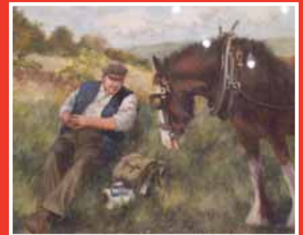
Noel Shaw - Oil

Viewing: Wednesday 10th December 3.00 – 4.30pm and 7.00 – 8.30 pm and Day of Sale from 4.00 pm -Further Details from the Auctioneers 028 276 67669-