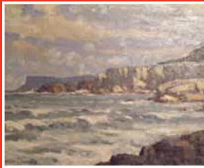
Maurce C Wilks - Oil