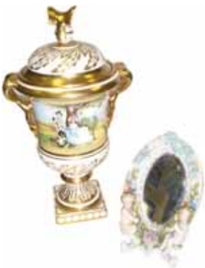
Lot 324 & 328