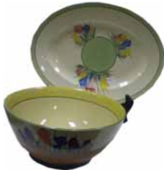
Lot 226 & 227