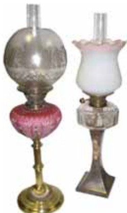
Lot 264 & 402