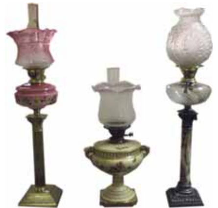
Lot 417, 418 & 420