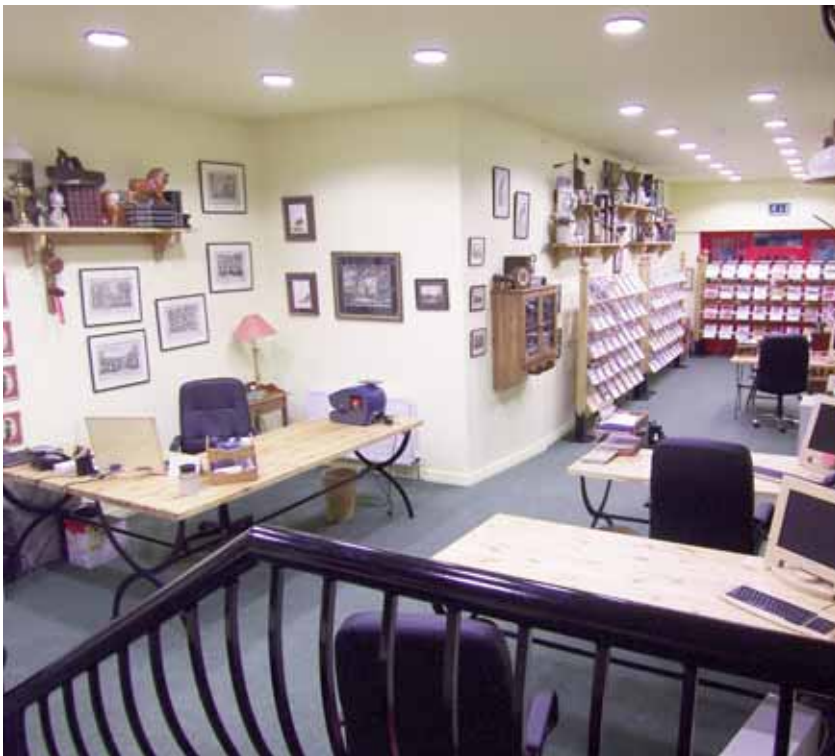
Spacious new interior of the Ballymoney extension

have seen many highs and lows – but property continues to be without doubt one of the best investments around. Our new extension is our commitment to the future. The market will lift again and as one of the provinces leading estate agents this new extension will ensure that we are ready.”