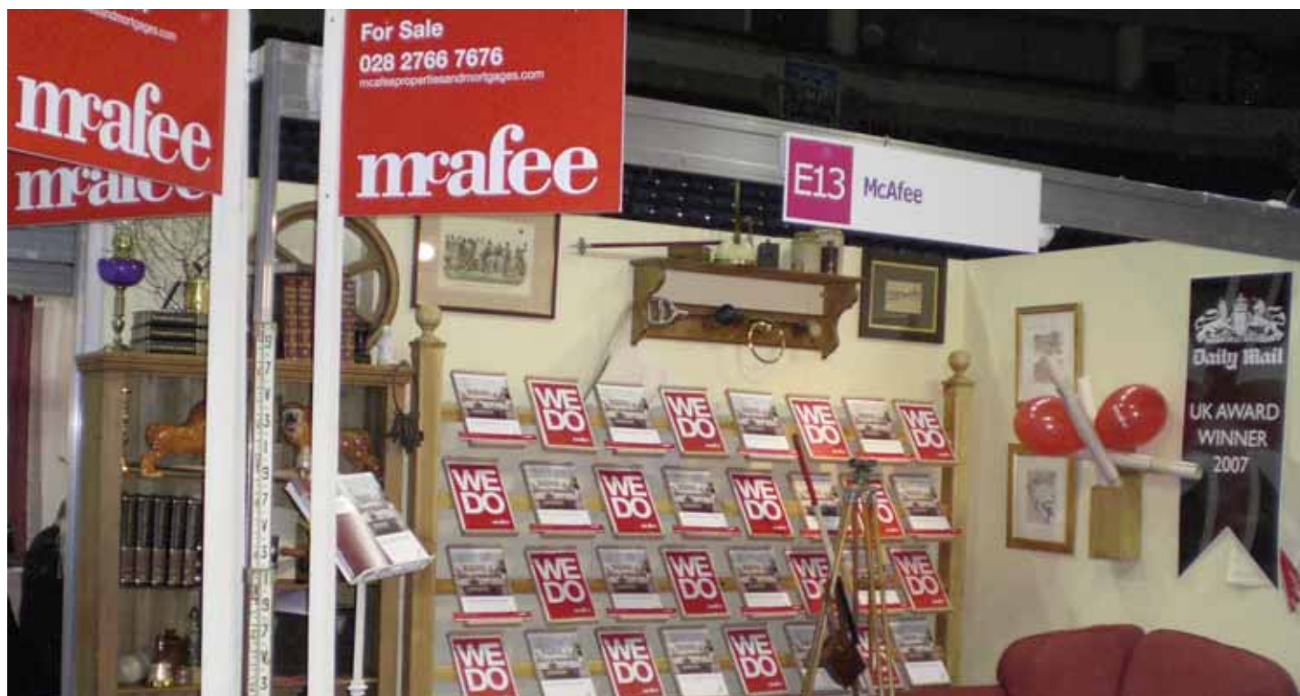
McAfee Properties and Mortgages stand at the Bridal Fair, The Odyssey, Belfast

At the beginning of October, McAfee Properties and Mortgages attended the Bridal Fair at the Odyssey, Belfast, to offer assistance to couples who were thinking of purchasing their new home.